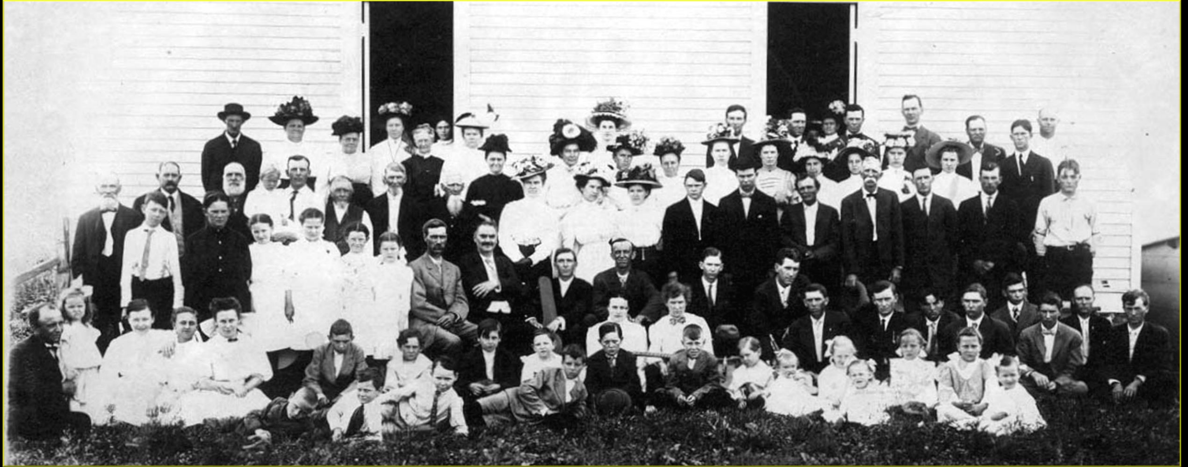
New Providence Predestinarian Baptist Church, DeWitt County, Illinois about 1908