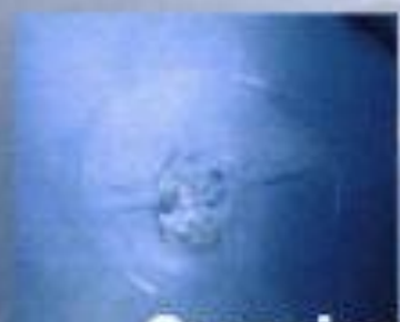
Crossing Path Chariot Wheels and bones